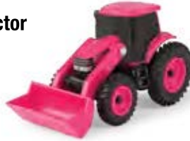
1:64 Case IH Pink Tractor with Loader 46705 Pack 8 - Age grade: 3+