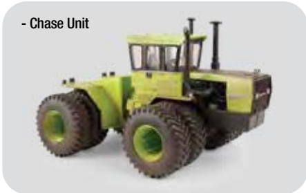
- Chase Unit

Configured with rear duals. Includes front weight, front fender, mirror, warning arm and rear light detail.