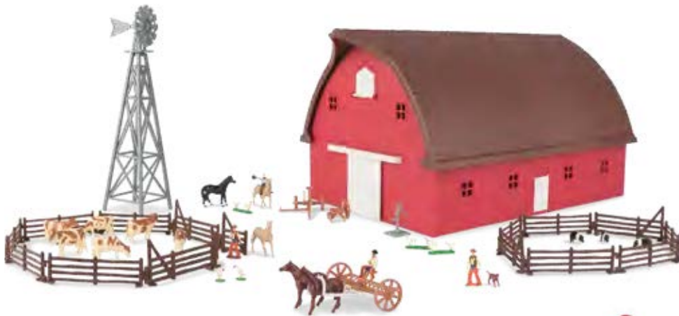
1:64 Farm Country Gable Barn 46765 Pack: 2 - Age grade: 3+