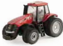
1:64 Case IH Modern Tractor 46502 Pack: 4 - Age grade: 3+