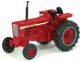
1:64 International Vintage Tractor 46573 Pack: 12 - Age grade 3+