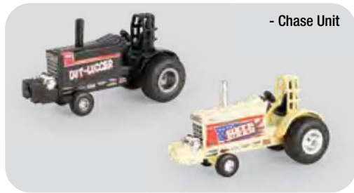
- Chase Unit