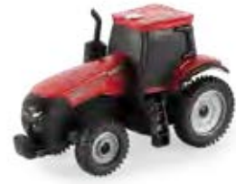
1:64 Case IH AFS Connect™ Magnum™ 380 Tractor 47166 MIN Pack: 4 - Age grade: 3+