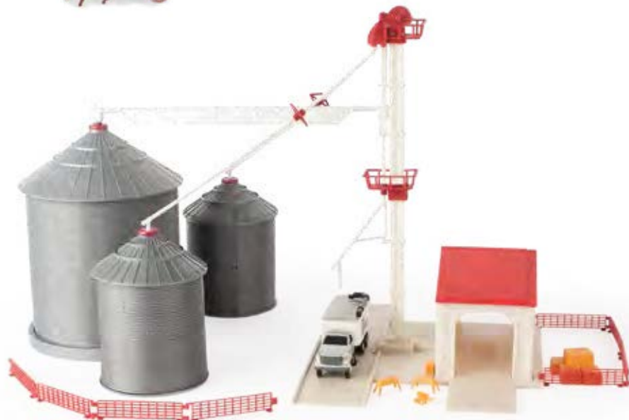
1:64 Grain Elevator Set 12924V Pack: 4 - Age grade: 5+