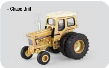
- Chase Unit