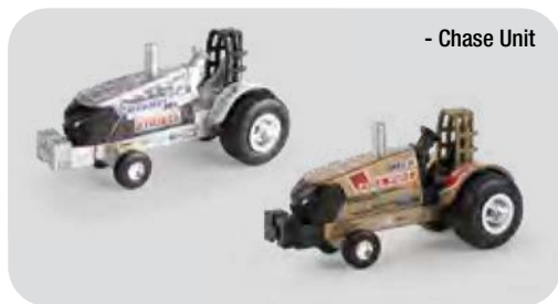
- Chase Unit

"Sixty-Sixer" puller tractor with chase unit.